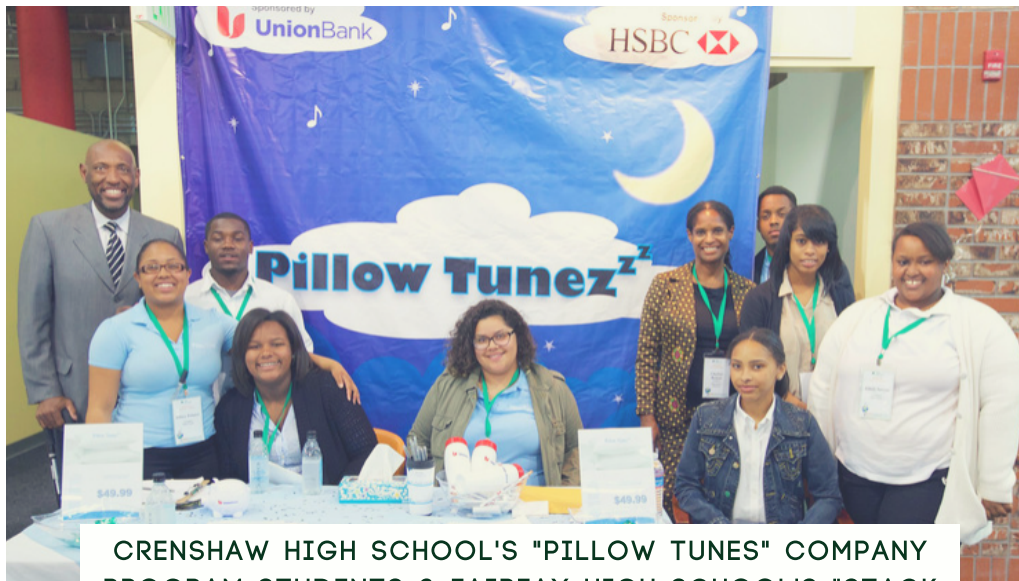
CRENSHAW HIGH SCHOOL'S "PILLOW TUNES" COMPANY PROGRAM STUDENTS & FAIRFAX HIGH SCHOOL'S "STACK RACK" STUDENTS EXHIBIT THEIR BUSINESS PRODUCTS.